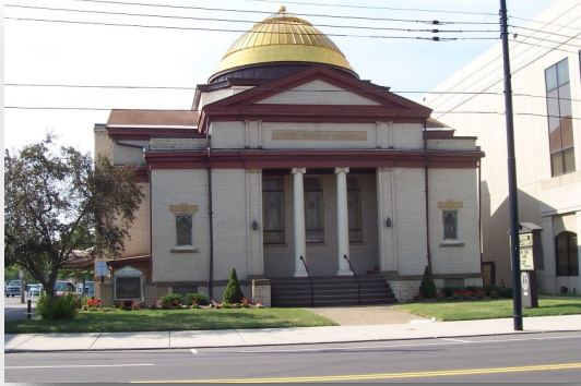
The church with the “golden dome”

280 E. Market Street Warren, Ohio 44481 (330) 394-4741 Email: firstuccwarren@gmail.com