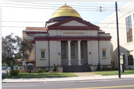
The church with the “golden dome”

280 E. Market Street Warren, Ohio 44481 (330) 394-4741 Email: firstuccwarren@gmail.com